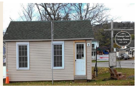
Cottage Museum in Bouckville